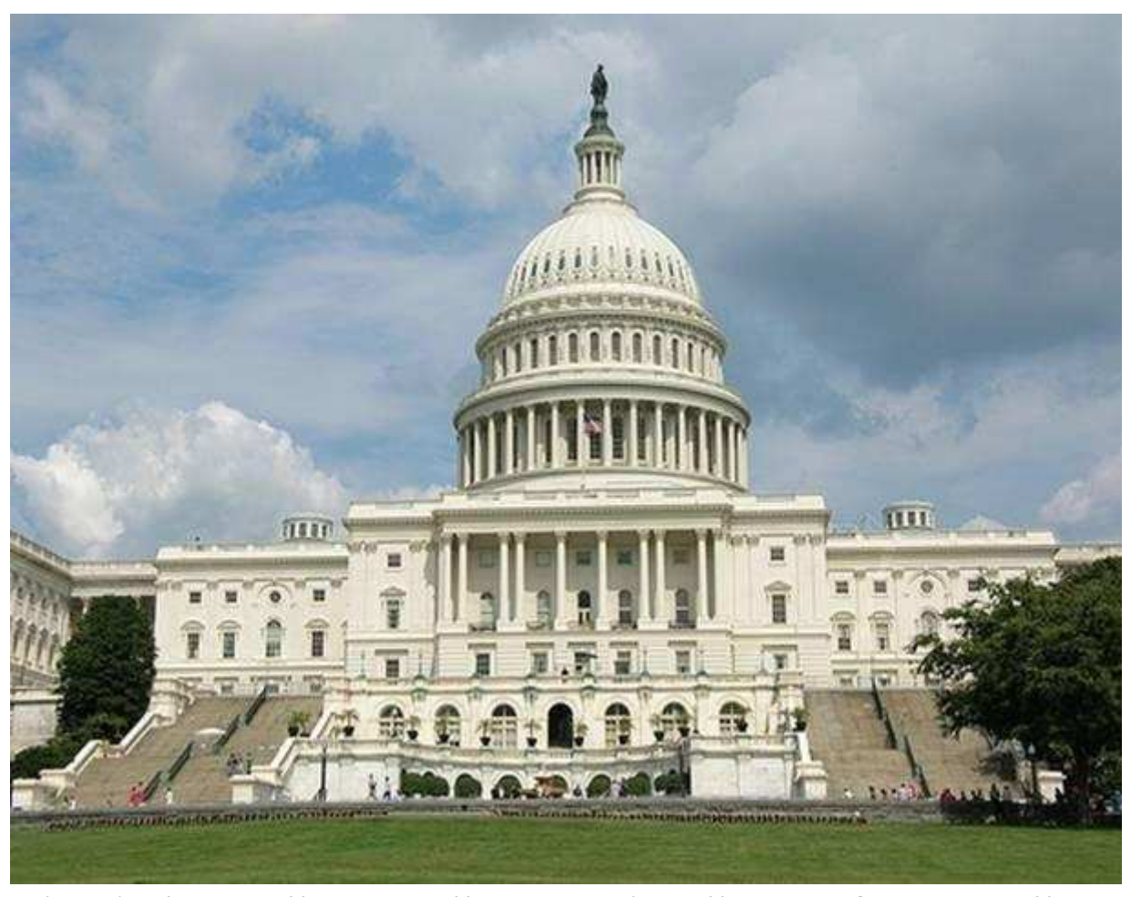
This hole swallows trillions and trillions of U.S. Dollars annually!

The money that falls into this hole is never heard from again!