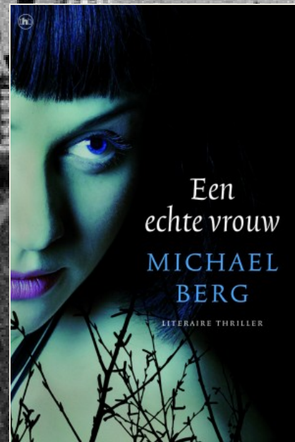
A REAL WOMAN