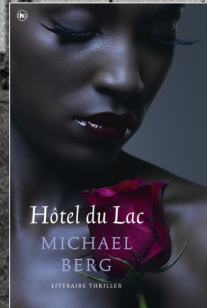
HOTEL DU LAC